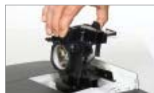
Easy lamp change.