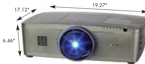
LC-XL200A - XGA • 3LCD "Conference" Projector.