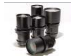
Range of wide-angle and telephoto lenses.