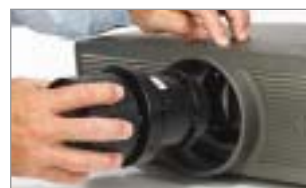
Quick lens change.