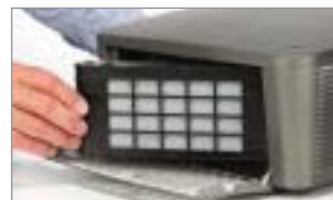
Replaceable air filter cartridge.