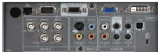
Here's everything you need to connect and project.