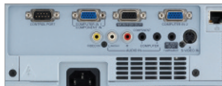
Just connect and project.