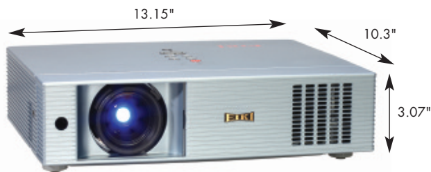
LC-XB43 - XGA • 3LCD "Brilliant" Series.

EIKI® is a registered trademark of Eiki International, Inc.