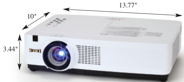
LC-XB250 • XGA projector

Includes a full complement of connections, including network control.