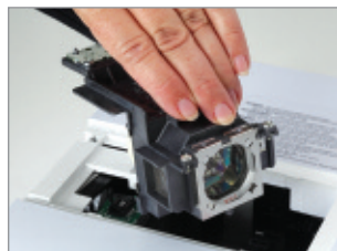
Easy to change long-life lamp.