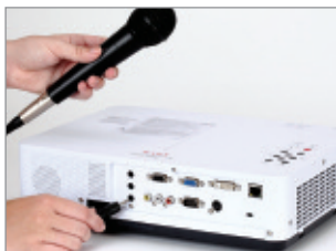
Built-in 10 Watt sound system.

Includes a full complement of connections, including network control.