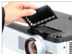
Handy access to air filter.