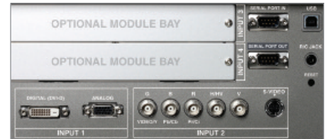
Ready to connect and project. Add Network, SDI, and more!