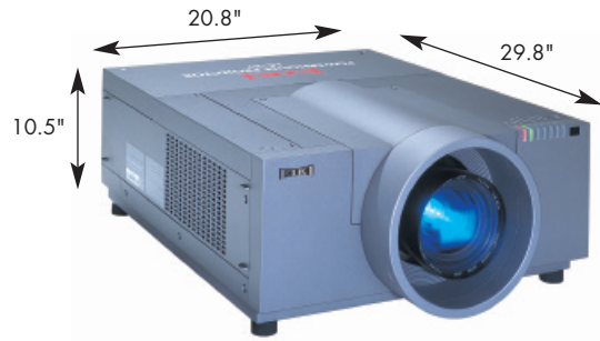
LC-X800 - XGA • 3LCD+One imaging engine.