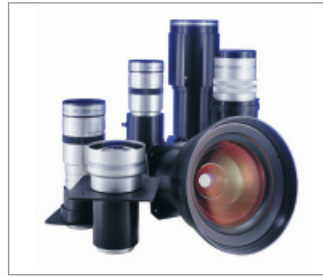
Broad selection of lenses.