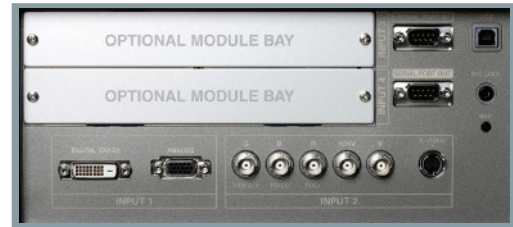
Ready to connect and project. Add Network, SDI, more!