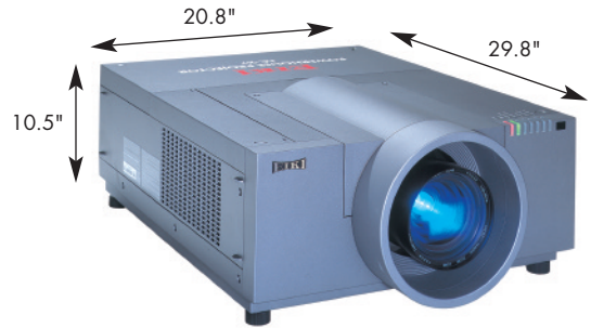
LC-X8 - XGA Powerhouse Projector.