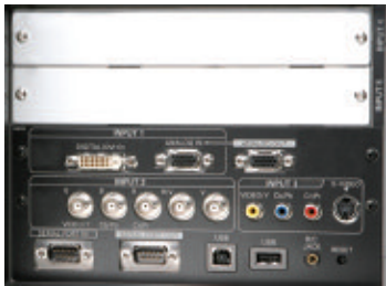
A full array of standard connections, plus spare bays for additional modules.