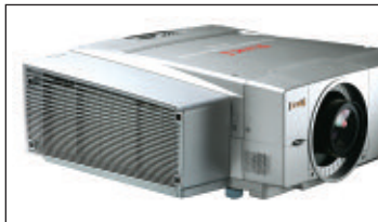
Optional smoke resistant external air filter box.