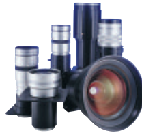
A range of wide angle and telephoto lenses is available to satisfy a variety of projection requirements.