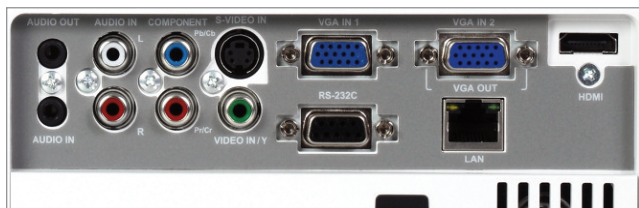
Includes a full complement of connections, including network control.

EIKI® is a registered trademark of EIKI International, Inc. Kensington® is a registered trademark of ACCO Brands Corporation.