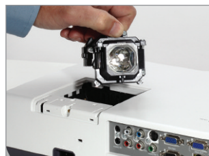
Easy to change long-life lamp.