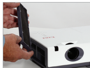
Handy access to air filter.