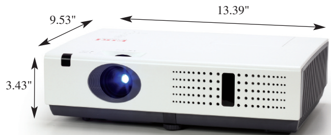
LC-WNS3200 • WXGA projector.