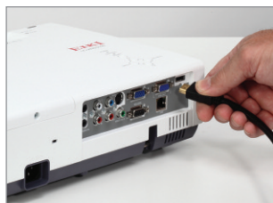
Just project and connect.