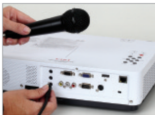
Built-in 10 Watt sound system.