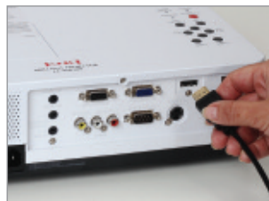
Connect and project.