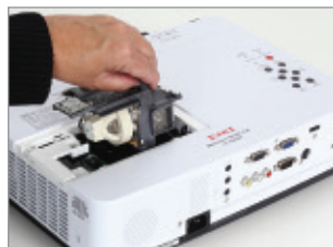
Easy to change long-life lamp.