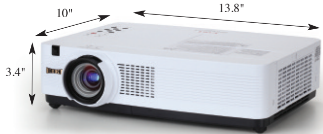
LC-WB200W • WXGA projector