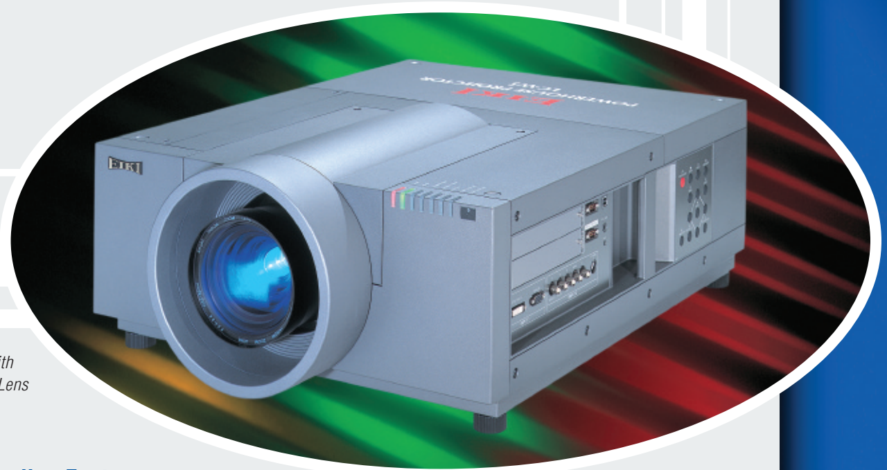
Shown with Optional Lens