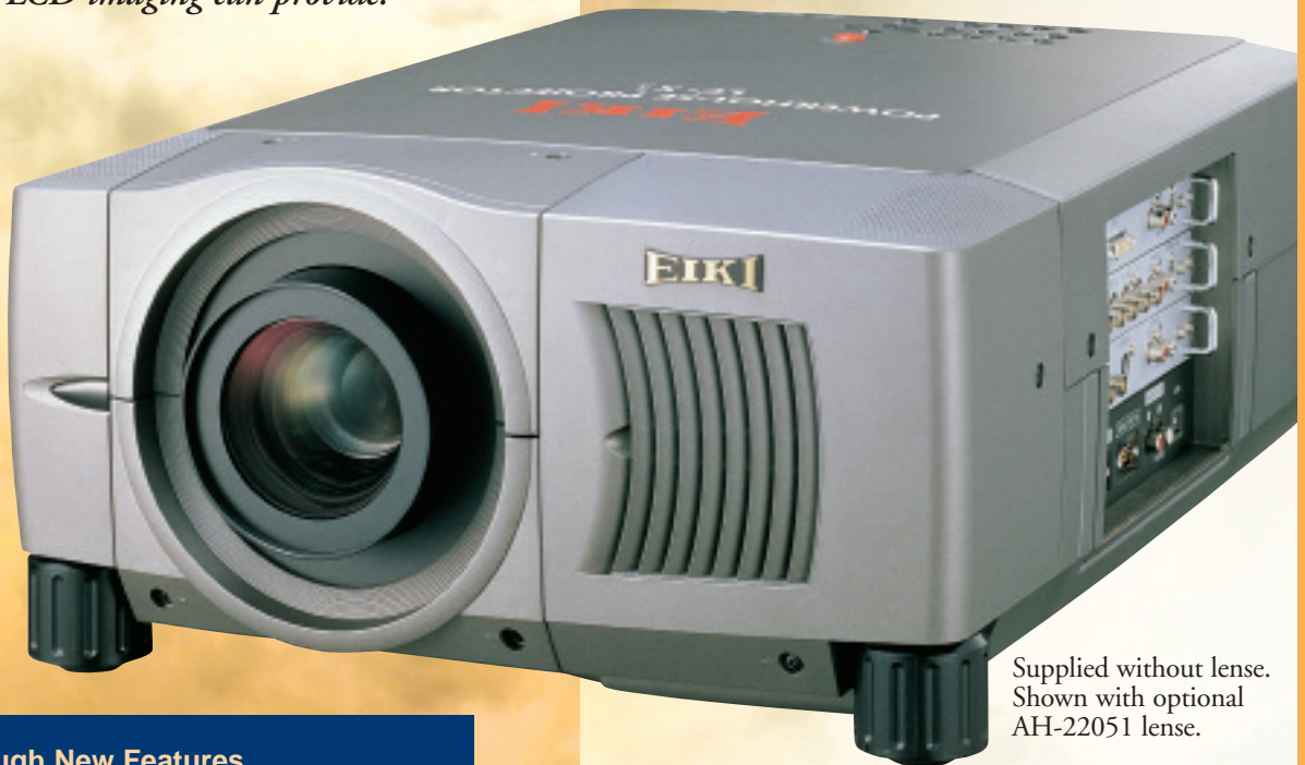
Supplied without lens. Shown with optional AH-22051 lens.

Here's true widescreen data and video projection, with high brightness and contrast, and all the color only 3 panel LCD imaging can provide.