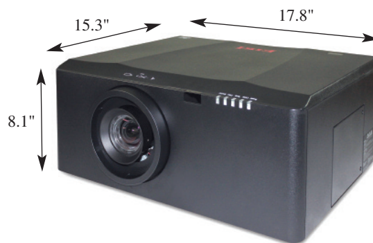
EK-612XA • XGA • 1-chip DLP® projector.