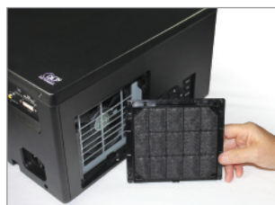
Handy access to air filter.

Includes a full complement of connections, including network control.