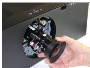
Easy to change lenses.