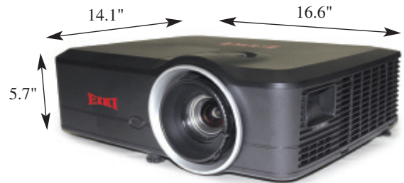
EK-600U • WUXGA • 1-chip DLP® projector. EK-601W • WXGA • 1-chip DLP® projector.