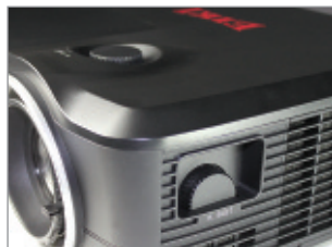
Easy vertical and horizontal shift controls.