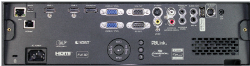
Includes a full complement of connections, including network control.

High Contrast, Vivid Colors, 1-Chip DLP® Technology. Cost-Effective Large Venue Performance. Crestron RoomView™ & AMX Device Discovery Technology.