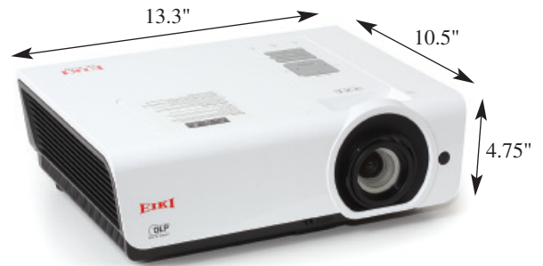
EK-402UA • WUXGA • DLP® projector. EK-401WA • WXGA • DLP® projector.