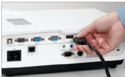
Connect and project.