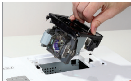
Easy to change long-life lamp.