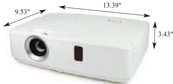
EK-103X • XGA • 3LCD projector.