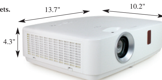
EK-101X • XGA • 3LCD projector. EK-102X • XGA • 3LCD projector.