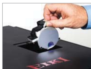
Easy access to color wheel.