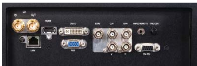
Includes a full complement of connections, including network control.

EIKI® is a registered trademark of EIKI International, Inc. Kensington® is a registered trademark of ACCO Brands Corporation.