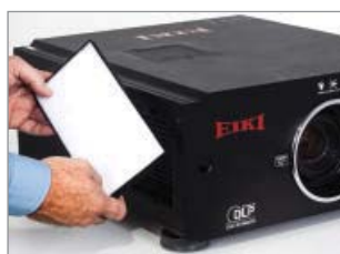
Handy access to air filter.