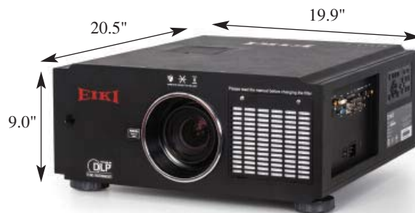
EIP-XHS100 • XGA projector.