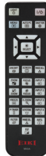
Full-function remote control.