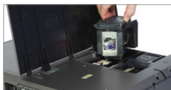
Top-accessed color wheels & lamps.