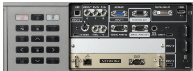
Complete local control, professional inputs, network module & expansion bay.