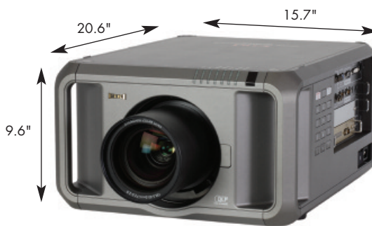
EIP-HDT20 – Full HD-1080p DLP® Theater Projector with enhanced color reproduction.

30251 Esperanza, Rancho Santa Margarita, CA 92688-2130 Tel: 800-242-3454; Fax: 800-457-3454, E-mail: usa@eiki.com In Canada, 310 First St.-Unit 2, P.O. Box 156, Midland, ON L4R 4K8 Phone: 800-563-3454, Fax: 800-567-4069 E-mail: canada@eiki.com http://www.eiki.com